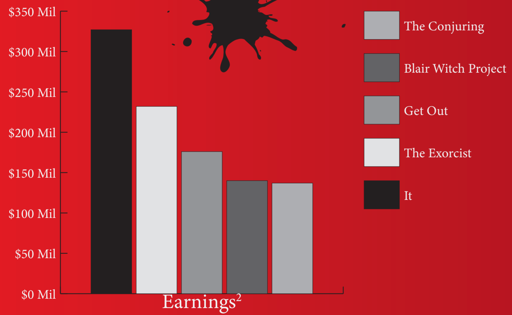
Horror Movie Gender Profile 3

We have Made two Graphs on this poster representing the top grossing r rated horror movies as well as the gender ratio for horror movies.