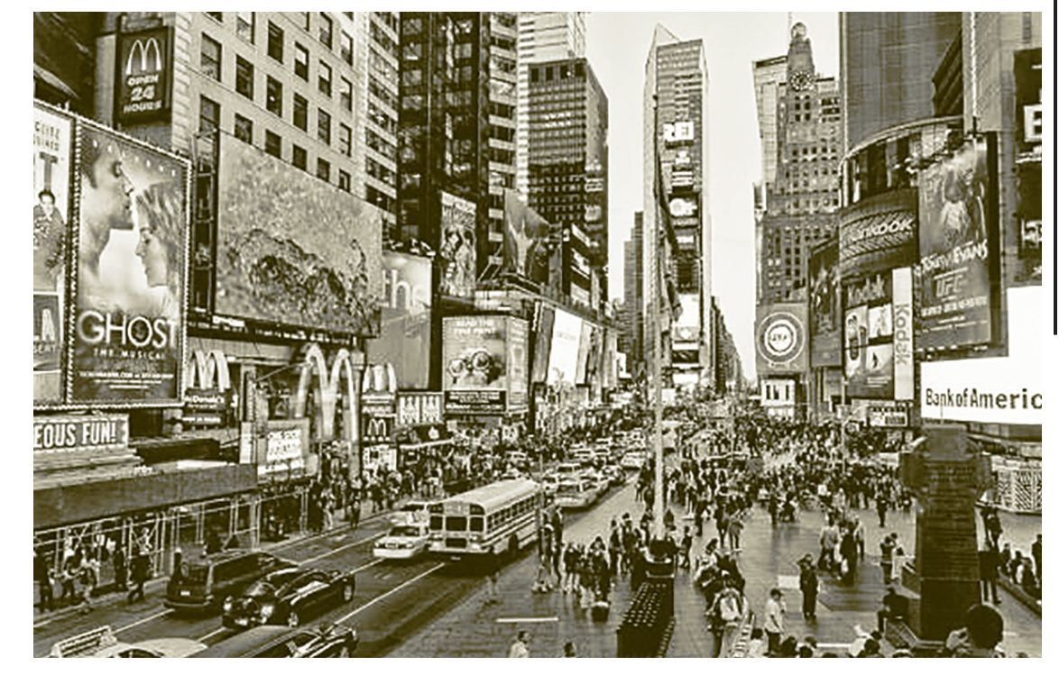
Each fall semester, the Visual Arts Department offers a 4-day field trip to New York City. Students travel by coach bus to a hotel on Times Square. While in New York, students visit major museums featuring some of