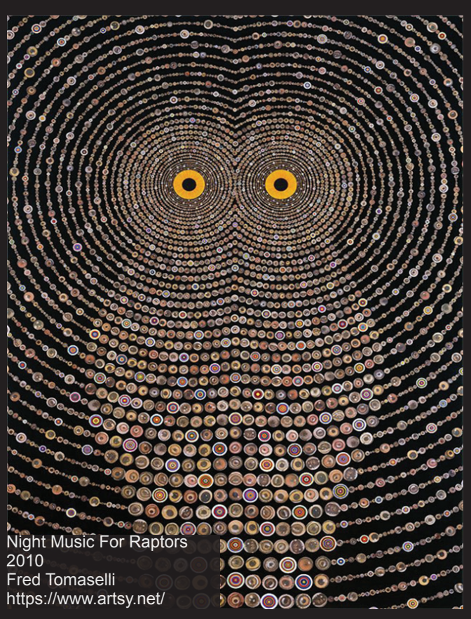
"Art is really about perception, and mine have been changed through visiting other realities"