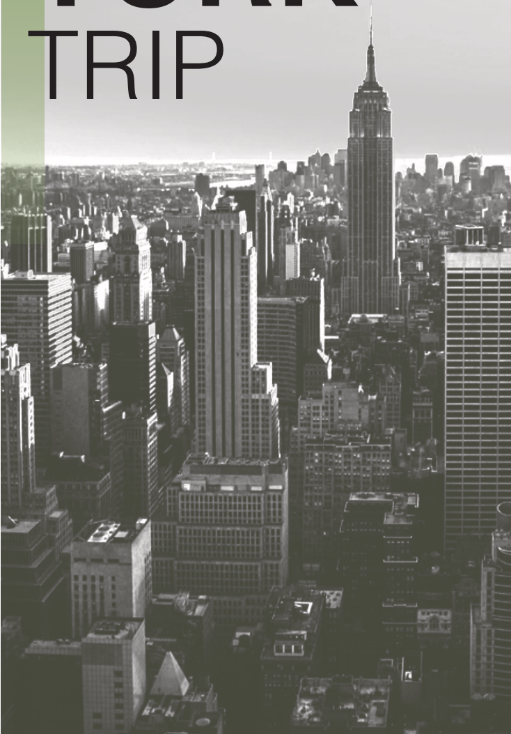
Empire State Building.