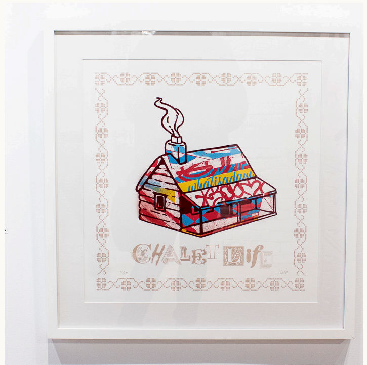
La Cabane à Sucre, a staple in Quebec Culture

As for what’s next with WIA, he continues keeps a low profile, but his work gets bigger.